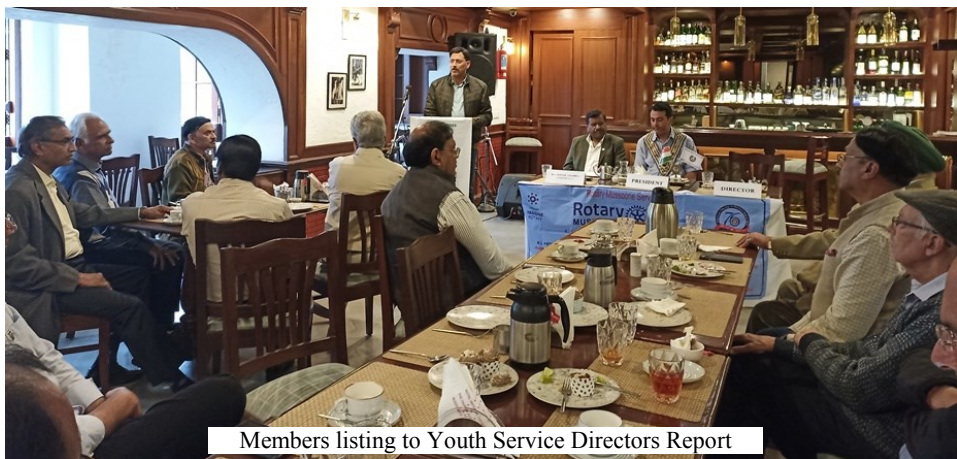
Members listening to Youth Service Directors Report