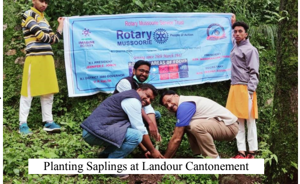
Planting Saplings at Landour Cantonment

Members of Landour Cantonment Board, Teachers and Students of Sanatan Dharam Sanskrit Mahavidhyalaya and Rotaractors participated in this social drive.