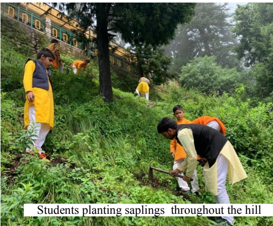
Students planting saplings throughout the hill

More than 60 saplings were planted in the hill below the cantonment office.