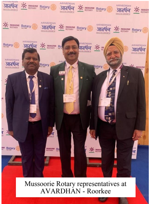
Mussoorie Rotary representatives at AVARDHAN - Roorkee